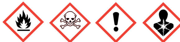
GHS02 GHS06 GHS07 GHS08

Signal word (GHS-US) : Danger Hazard statements (GHS-US) : H225 - Highly Flammable liquid and vapor H301 - Toxic if swallowed H311 - Toxic in contact with skin H314 - Causes severe skin burns and eye damage H317 - May cause an allergic skin reaction H318 - Causes serious eye damage H331 - Toxic if inhaled H335 - May cause respiratory irritation H370 - Causes damage to organs H402 - Harmful to aquatic life